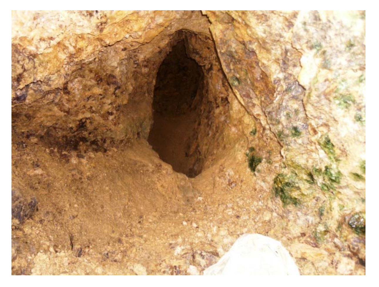
View of entrance to one of the workings