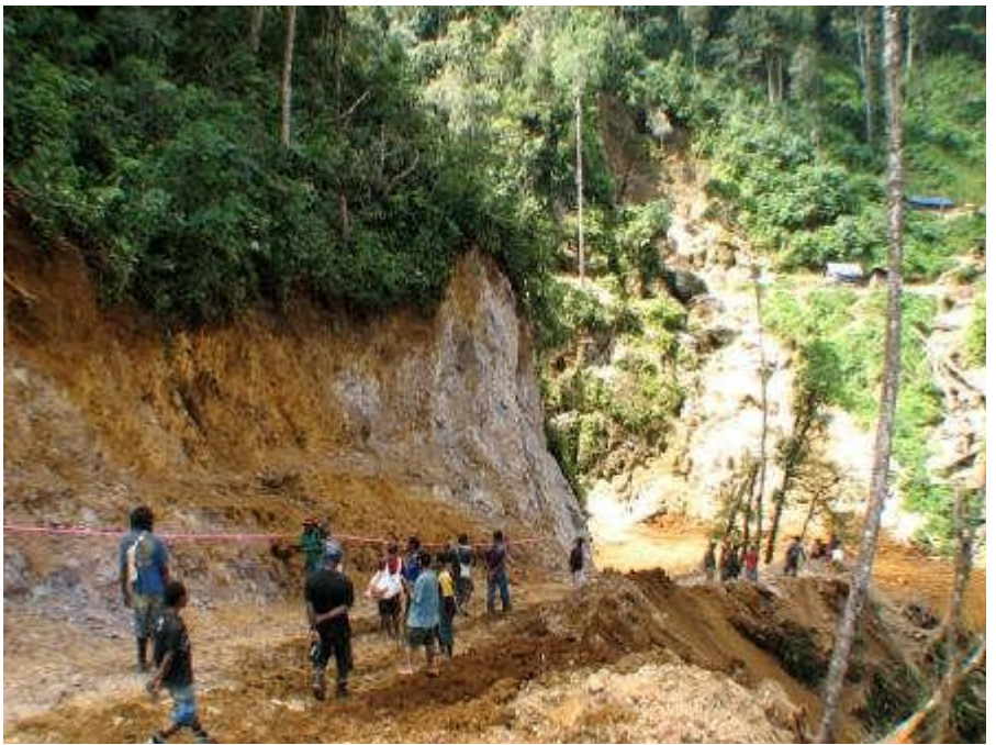
Road cut across spur with part of artisanal mining area in background.

The benching and channel sampling work to date has highlighted the widespread lateral extent of anomalous surface gold values coinciding with the outcrop area of the Nevera Igneous Complex over an area of approximately 7 hectares which includes the artisanal gold workings on the Prospect's western slopes The gold mineralisation at surface is largely confined to narrow oxidized base metal sulphide-carbonate veins infilling joints and fractures, commonly with a medium density but in places forming stockworks, and is interpreted to be related in style to the significant drill intercepts encountered by the previous drilling several hundred metres beneath the ridge surface .