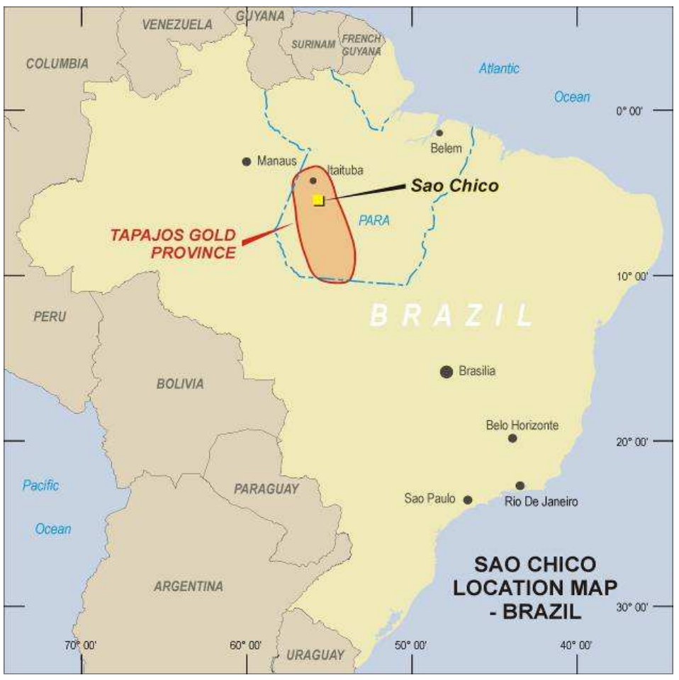
Location of Sao Chico project

Sao Chico Project can be put into limited production by the end of the calendar year, building up to an annualised gold production rate of some 20,000ozs per annum at a cash operating cost of less than US$200/oz and less than US$340/oz after the NPIR payment. As production is initially planned from near surface mining utilizing equipment that can mostly be hired from local sources, capital expenditure to commence production is expected to be less than US$450k.