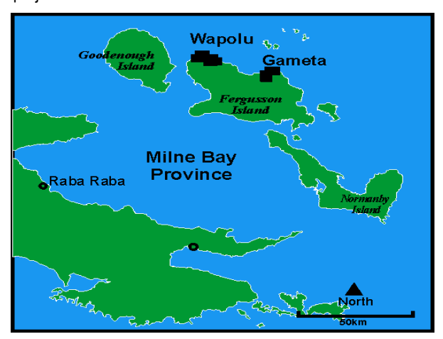
Location of the Wapolu & Gameta tenements, Fergusson Island, PNG

In May 2008 the Company entered into a Joint Venture Agreement with BacTech (Barbados) Limited ("BBL") a wholly owned subsidiary of BacTech Mining Corporation (BacTech) of Canada over its Fergusson Island Gold Project in Papua New Guinea. However, during the quarter, BacTech advised that BBL is now being replaced by BacTech Gold Corporation ("BGC") under the same terms and conditions. BGC, also a wholly owned subsidiary of BacTech, has been specifically established to evaluate the commercial use of BacTech's bacterial oxidation expertise on acquired refractory gold projects.