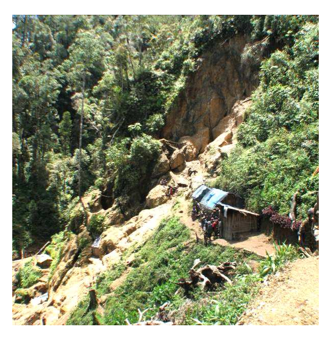
Crater Mountain artisanal workings - Nevera Prospect

Management believes that production at Crater Mountain could commence on a small scale within 12 to 18 months, with proceeds from production available as required for financing ongoing exploration.