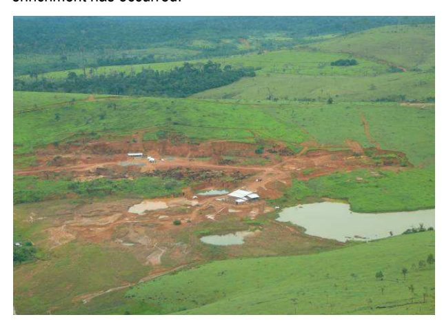
Aerial View of Sao Chico

Small scale alluvial gold mining has been previously undertaken at Sao Chico by garimpeiros (local miners) who have encountered gold grades varying from a trace up to in excess of an ounce per tonne, particularly in the uppermost portion of the veins where supergene (secondary) gold enrichment has occurred.